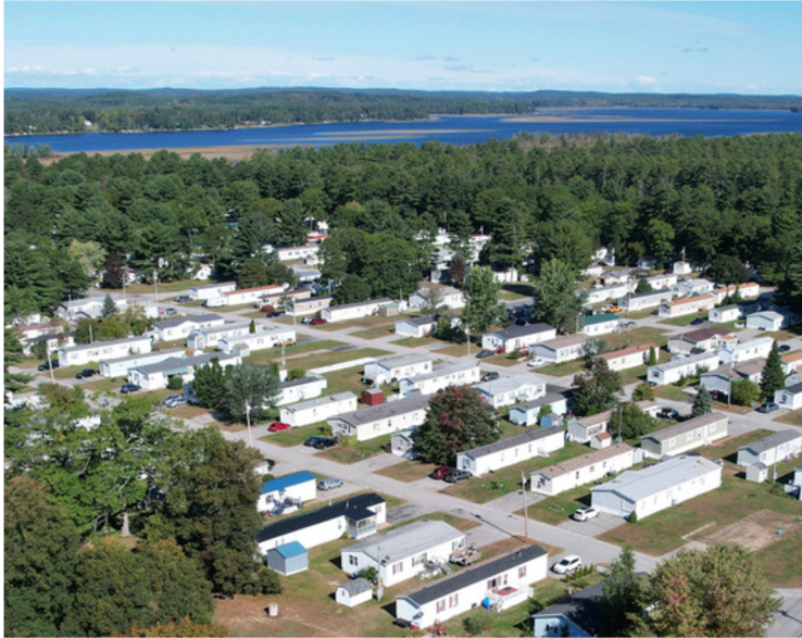
Aerial image of Bay Bridge Estates.