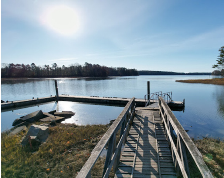
Image of Porter's Landing.