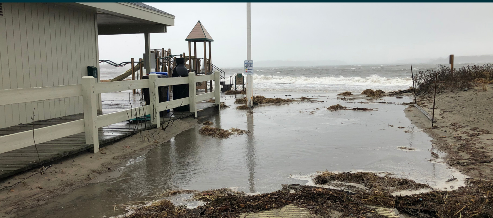
Storm surge at Willard Beach.