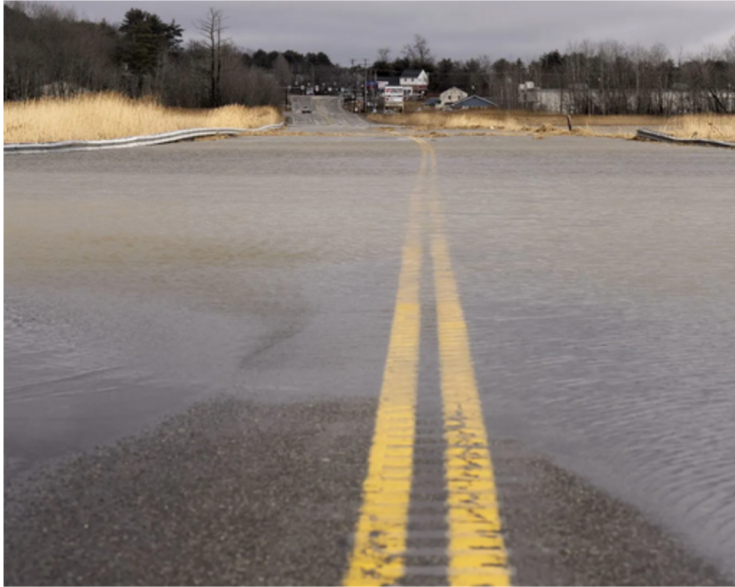
High tide event flooding on US Route 1 across marsh.